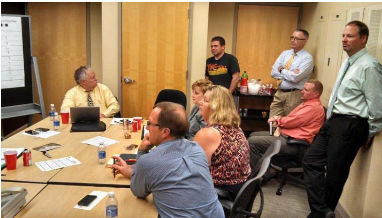
At the Southwest Chapter Repositioning meeting.

Last week I had the pleasure of attending the Southwest Chapter's Repositioning community conversation. Everyone met at the offices of Diekema Hamann in Kalamazoo and the meeting was productive and respectful.